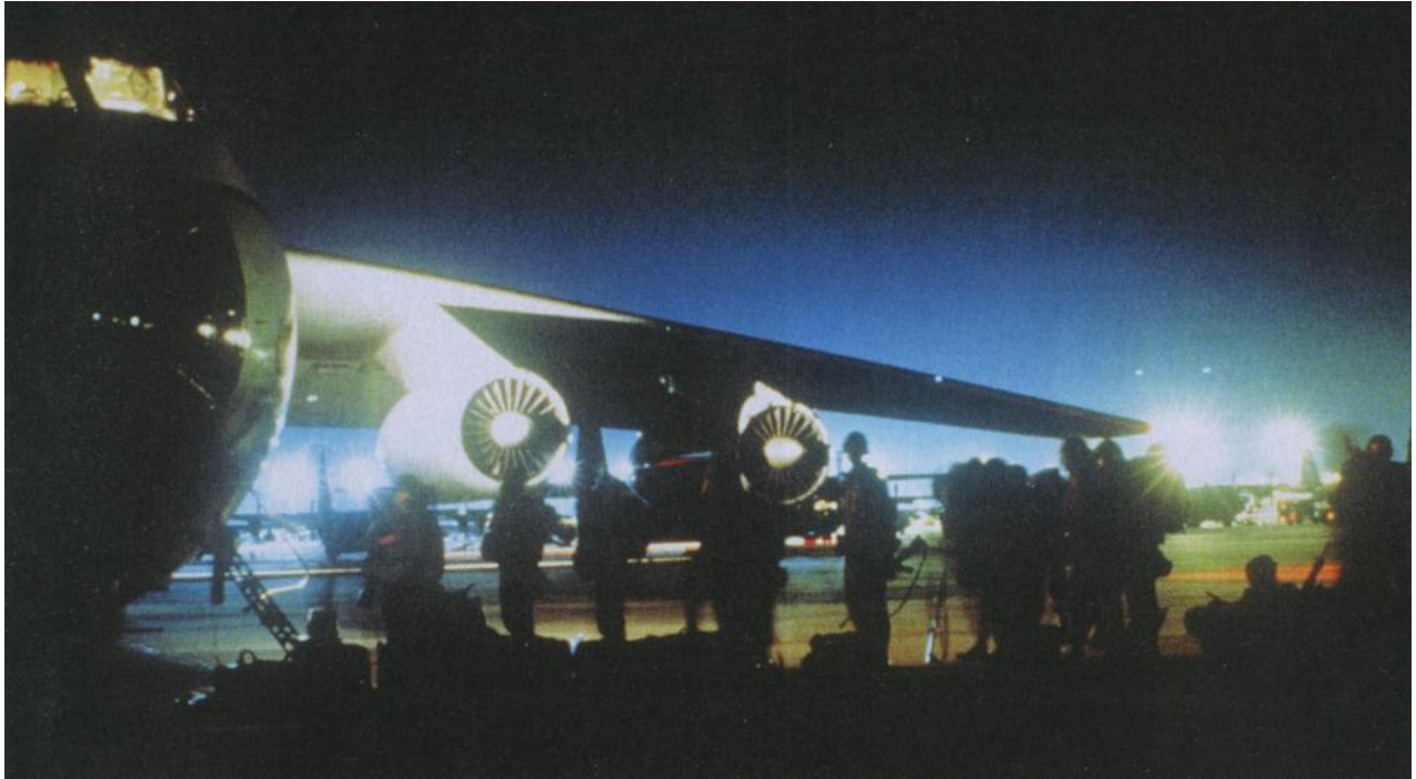
Above: Flight line floodlights reveal members of the Army's 82nd Airborne Division boarding a C-141, ready to take off for Grenada.