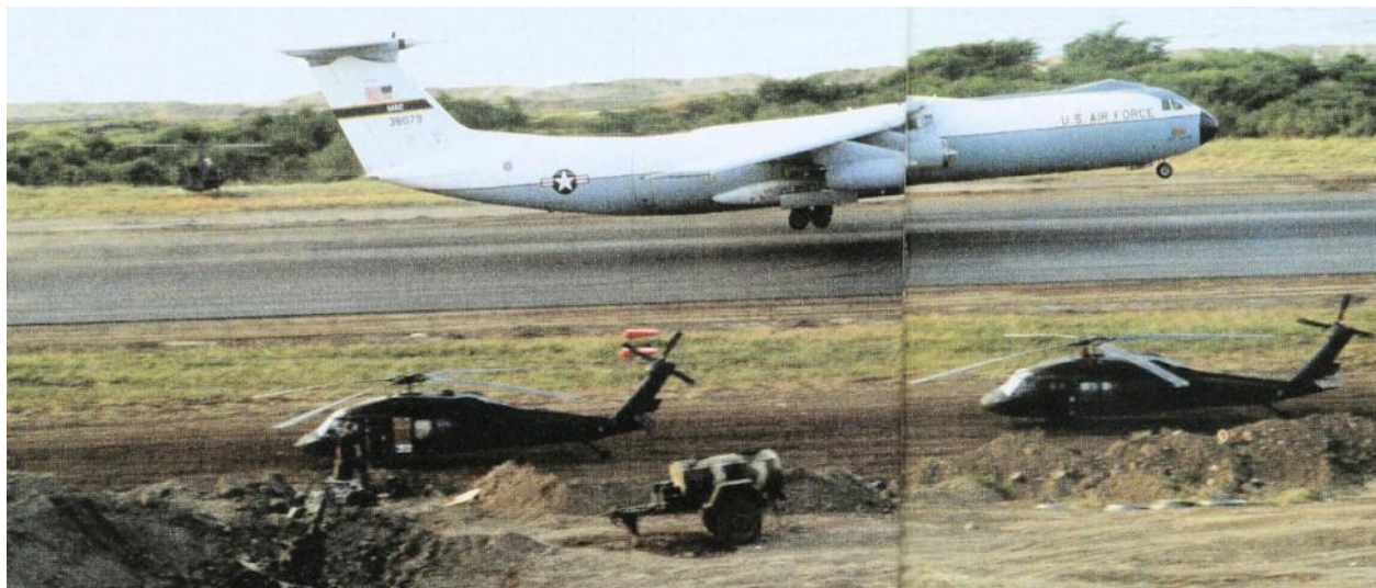
Above: A USAF C-141 takes off from Point Salines during Urgent Fury. C-141s brought in two battalions from the Army's 82nd Airborne Division to reinforce Army Rangers already on the island.

The operation was beset with other problems as well. Army and Navy radios could not communicate with each other. The Rangers and airborne troops could see the ships offshore but had to send their requests for fire support to Fort Bragg, which relayed the messages by satellite to the ships.