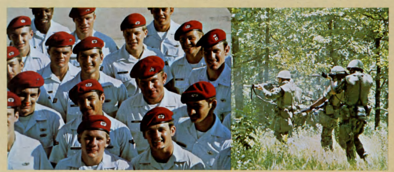
Graduates of the Combat Control School at Little Rock AFB, Ark., earn scarlet berets. Their training includes live firing on the "pop-up" target range.

he job isn't for everyone, and it's not meant to be. It's packed with risks, and heavy demands, but it also offers numerous rewards —overseas travel, extra pay, and getting into the action as an instrument of the United States' foreign policy.